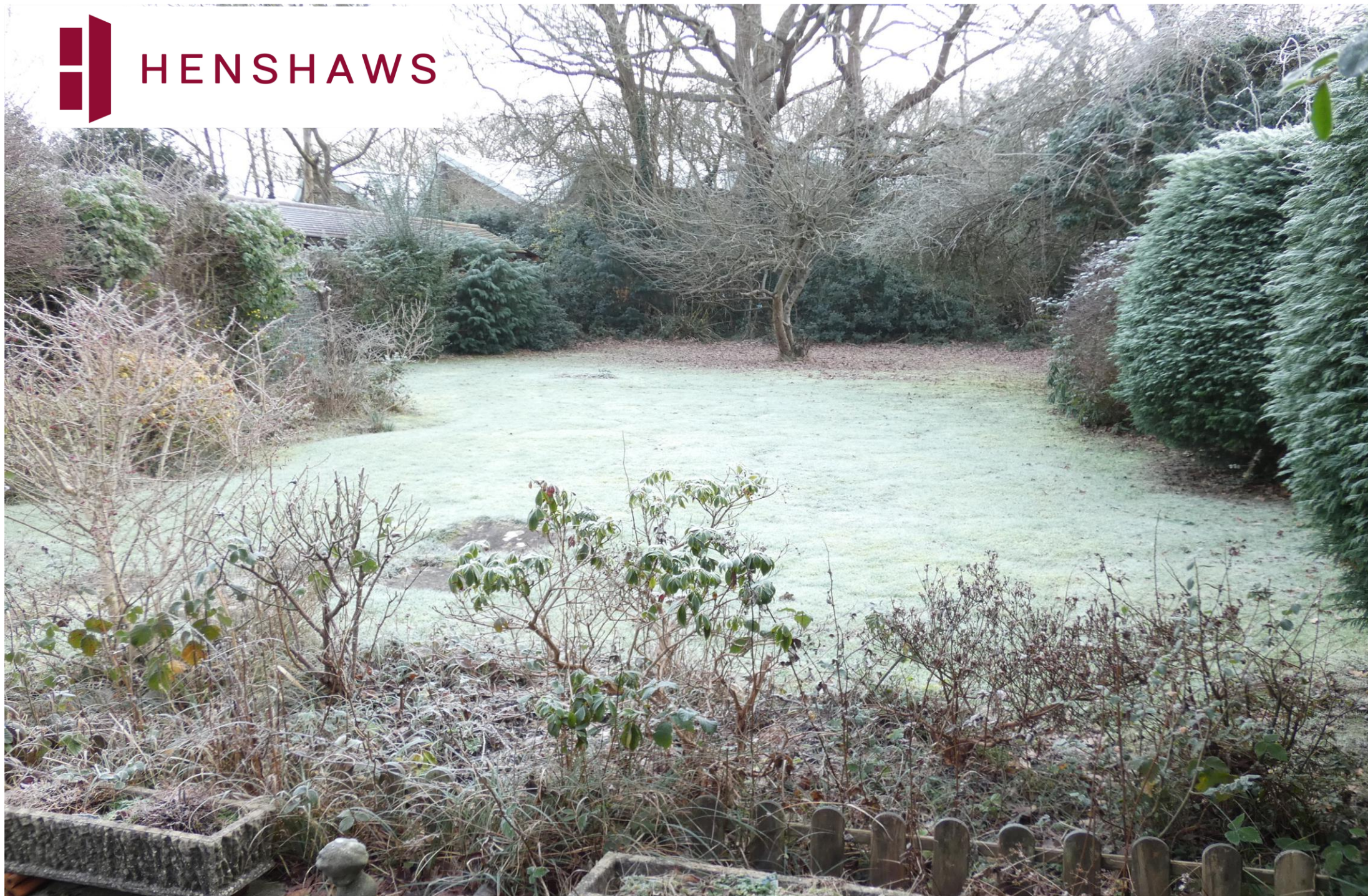
Tithe Cottage, Forest Road, Effingham Junction , Surrey, KT24 5HE